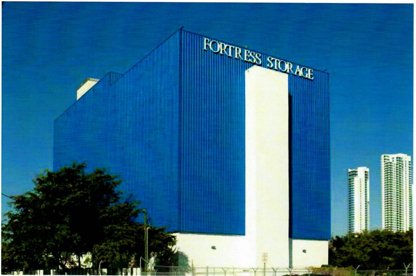
The Fortress building in Miami, Florida is located at 1629 N.E. 1st Avenue, 33132.