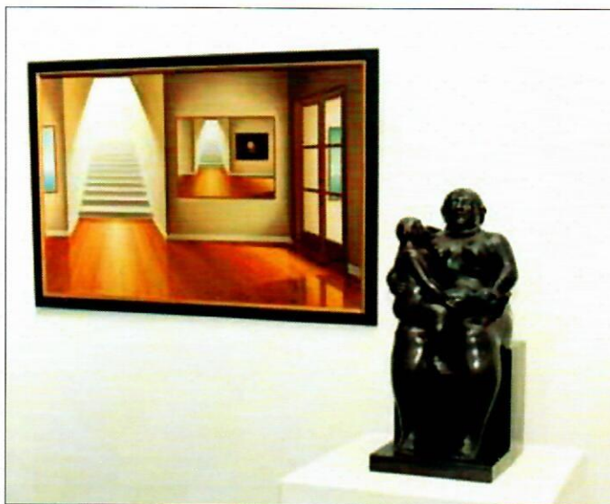
Fernando Botero sculpture on display in Fortress’ viewing gallery.